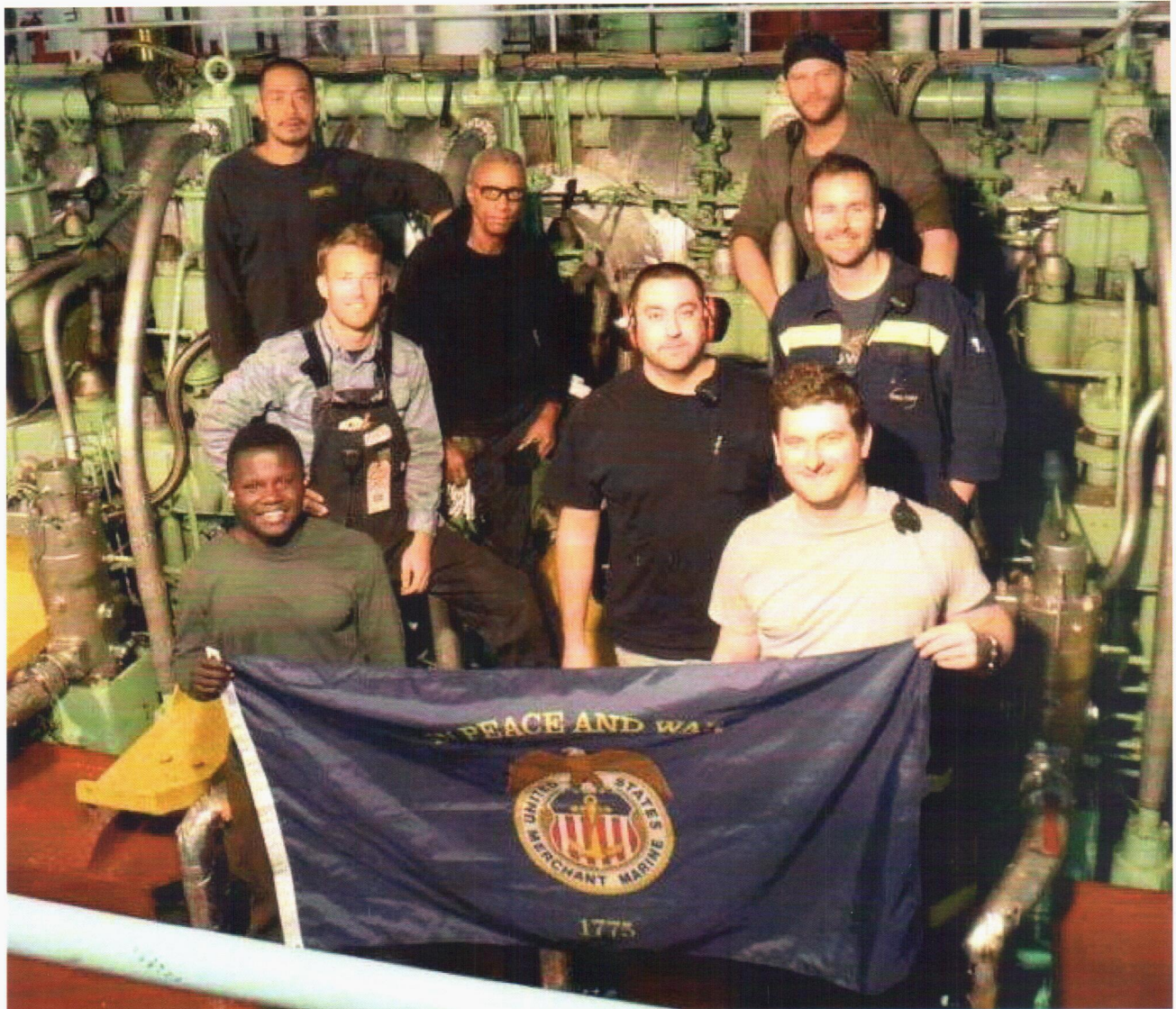
(Photo: The engine crew on the container ship APL GUAM keeps things running smoothly on another successful overseas run)